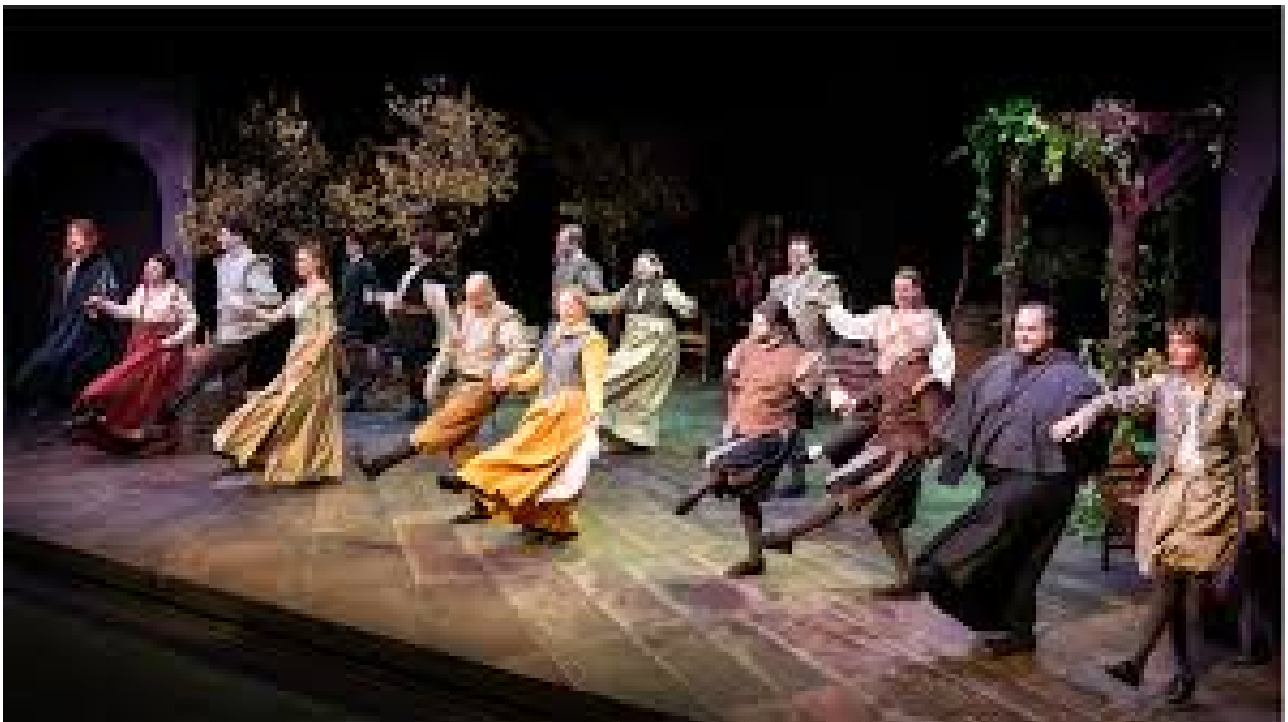
Midland Gate Shopping Centre