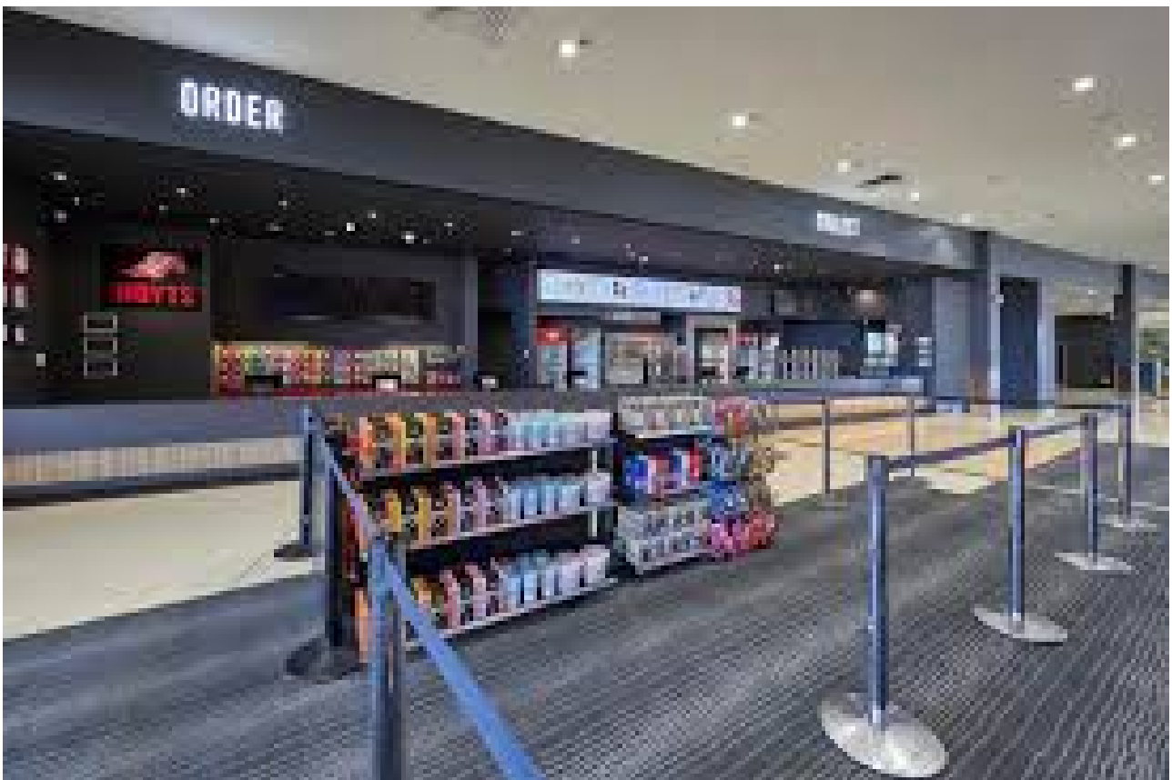
New Midland Train Station